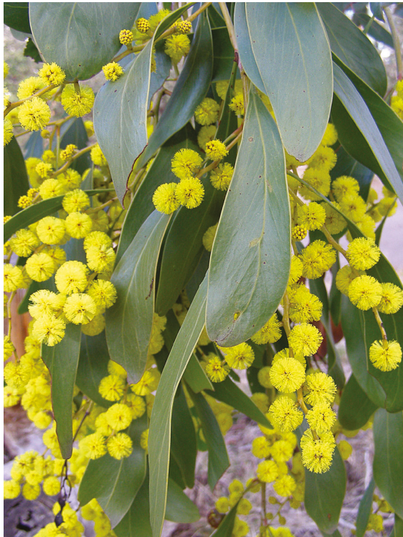
Golden Wattle ( Acacia pycnantha )