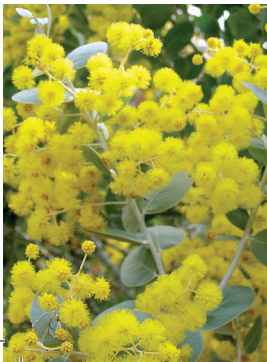
Snowy River Wattle ( Acacia boormanii )